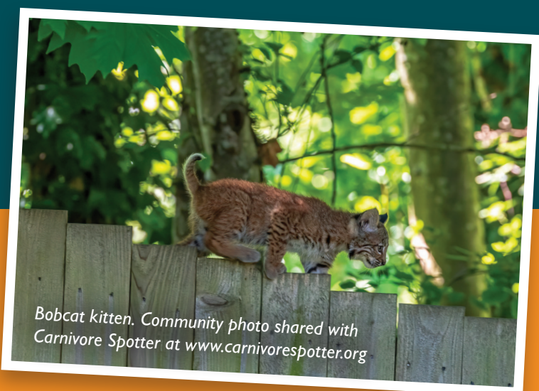
Bobcat kitten.

These actions will be most effective if we all work together. Please collaborate with your neighbors to help your community coexist with wildlife!