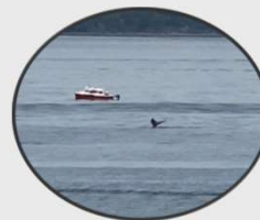
Humpback whale ( Megaptera novaeangliae) observed by brooklyn