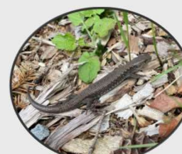
Northern alligator lizard ( Elaria coerulea ssp. Principis)