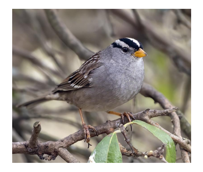
White-crowned sparrow by Doug Greenberg is licensed under CC BY-NC 2.0.