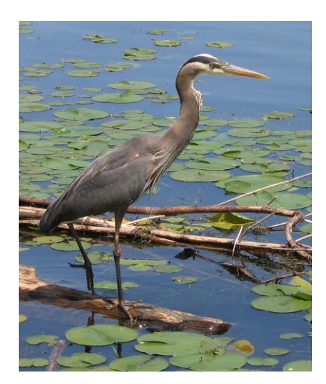
<u>Heron</u> by <u>Alexandra MacKenzie</u> is licensed under <u>CC BY-NC-ND 2.0</u>.