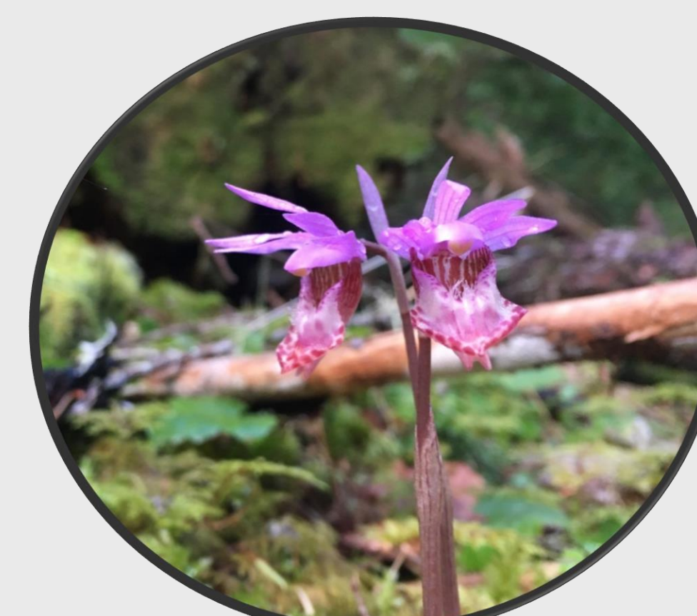
Western fairy-slipper ( Calypso bulbosa var. occidentalis ) observed by kellyjin Photo © Kelly Jin https://www.inaturalist.org/observations/76846225