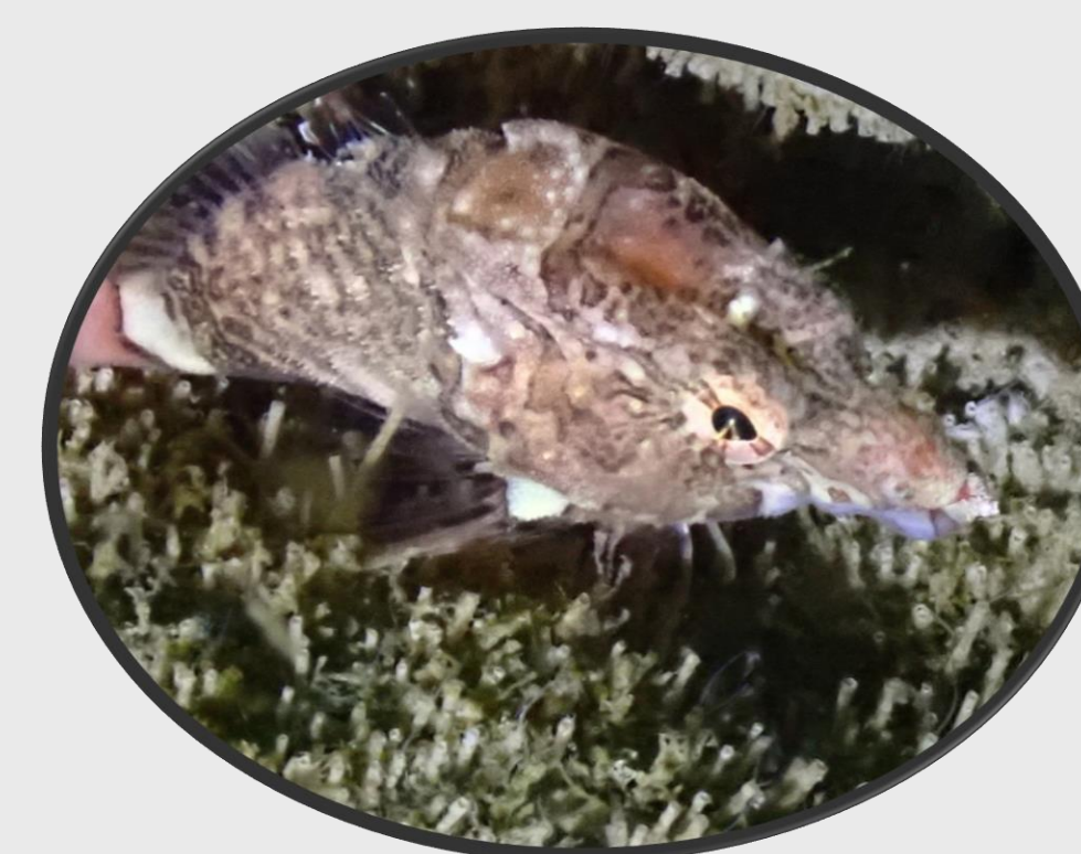
Grunt sculpin ( Rhamphocottus richardsonii ) observed by canaryrockfish