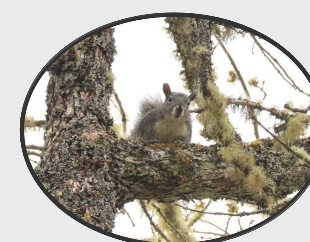
Western gray squirrel ( Sciurus griseus ) observed by hawnzd Photo © Zach Hawn https://www.inaturalist.org/observations/76358532