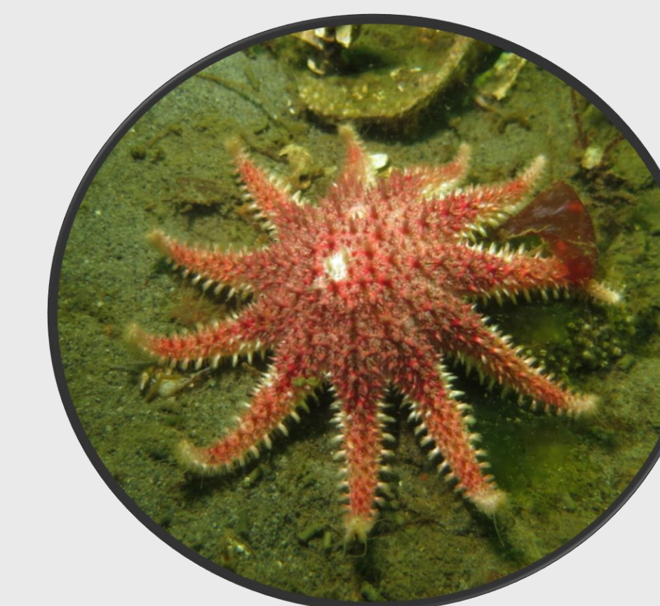
Rose sun star ( Crossaster papposus )