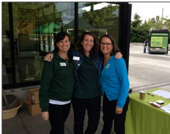
Your WPZ neighborhood team.