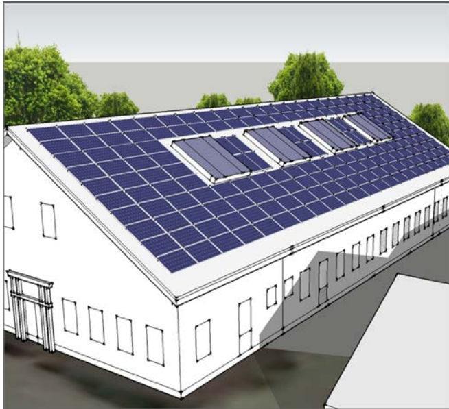
Rendering of the Commissary building after panels are installed.

This isn't the first solar energy project at the zoo. In 2011, solar panels were installed on our Historic Carousel, providing enough renewable energy to power the carousel all year long. That's 100,000 rides worth of power! Even our parking meters feature small solar panels. The community solar project is one more exciting next step toward the zoo's sustainability goal to reduce carbon use by 20 percent from 1990 levels by 2020.