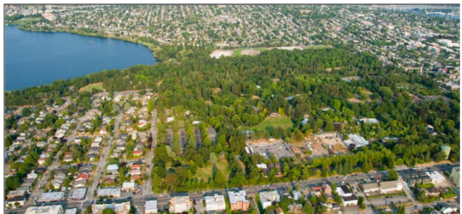
Aerial view of the zoo and tree canopy.

Unfortunately, we do not have the authority to enforce parking off zoo grounds, although at times we spot-check streets surrounding the zoo during busy events. Because you and your neighbors are the eyes and ears of the area, we strongly encourage you to report parking offenses to the Seattle Police Department, reachable through the parking enforcement main line at 206-386-9012.